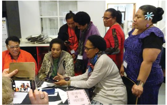
Pasifika ladies practising their music