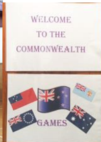
Commonwealth Games night at St Peter's and the winning Team Samoa (below)