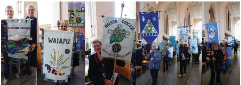
Banner parade at AAW Commissioning service